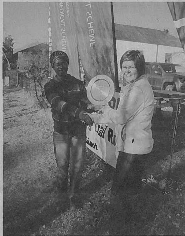
Presentation of Rhodes Youth Forum trophy