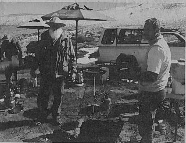
Lamb Testicle Stew ("Berg Oysters")