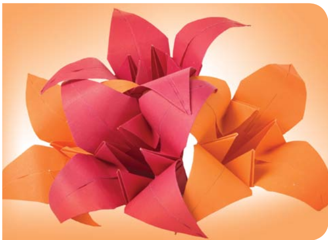
Careful attention to detail in Liberty Medical Scheme's fresh new look

A uniquely crafted new look for Liberty Medical Scheme.